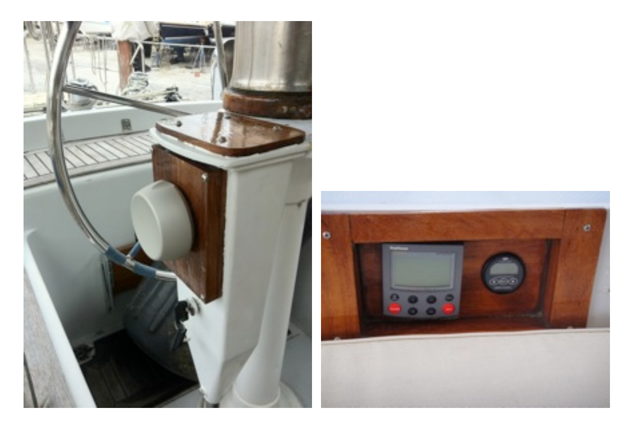
At the Helm - Key and Throttle (left) and Battery Monitor and Auto-pilot Controls (right)

In the motor compartment, the remaining components are readily accessible despite the batteries occupying much of the space. In addition to the motor, motor controller, and batteries; we also located the two battery chargers in the motor compartment.