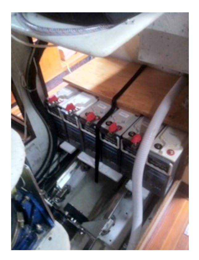
New Motor Mounts, Battery Platform, and Unfinished Wire Platform

After mounting the motor and batteries, the next steps were to attach the batteries and the different motor components: motor controller, key, throttle, and battery monitor.