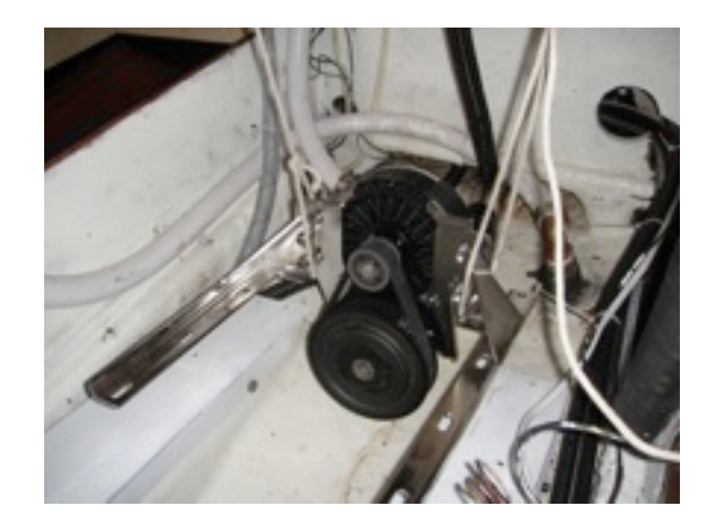
New Wider Struts with Motor Suspended Above for Initial Measurements

In addition to the narrower motor supports, the vertical length of the new motor was smaller. To adjust for height and allowing for motor shaft and propeller shaft alignment, we used motor mounts rated for much more weight than was required but allowed for greater flexibility in the height adjustment of the motor. The motor mounts we selected were R&D mounts - model 800-021 - and provided over 5 inches of vertical adjustment.