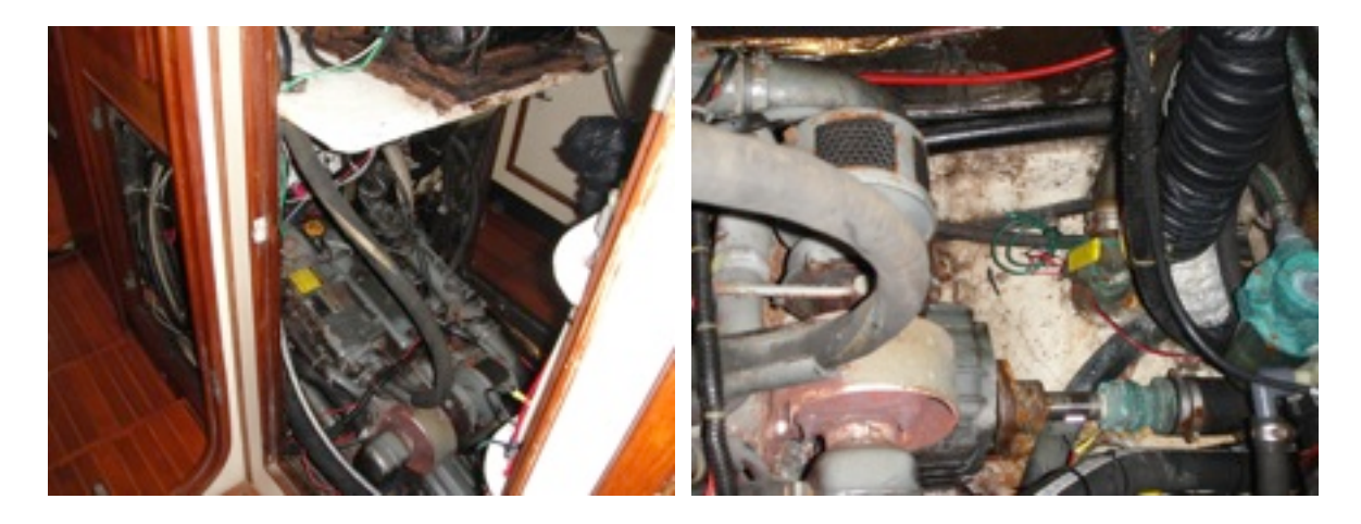
Engine Compartment - Prior to Removal

Our sailboat had an existing Yanmar 4JHTE diesel engine that is rated for 55 H.P. and it had approximately 5,500 hours of runtime. This number is approximate because the hour gauge was replaced by a previous owner of the boat. The engine ran well enough when supplied with clean fuel. It could push the boat at over 6 knots while burning an average of 1.25 gallons of diesel an hour (based on personally collected data).