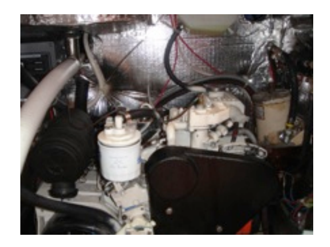
Existing Genset - 5.5 Kw NextGen Generator with 240v AC Output

Prior to converting to electric propulsion, our boat had a single 30 amp shore power inlet and the genset was wired for 120v AC output. During the conversion, we added a second 30 amp shore power inlet and rewired the genset to 240v AC output. This shore power configuration allows us to use one shore power line to supply our house bank charger, water heater, and AC outlets and the second shore power line to supply our Sterling 24v30 charger and our other AC loads.