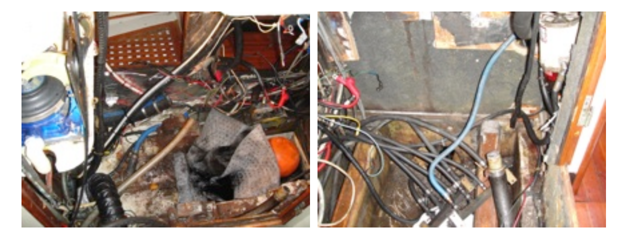
Engine Compartment - The Clean-up Process

Finally, we applied several coats of Interlux Bilgekote paint to a provide a "like-new" environment that makes maintenance inspections easier and helps to protect the bulkheads and bilge.