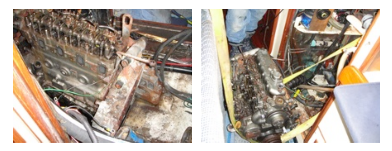
Engine Compartment - During Removal