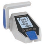
Evo Top Mount Control $330.00

You could always find a control that best fits your boat.